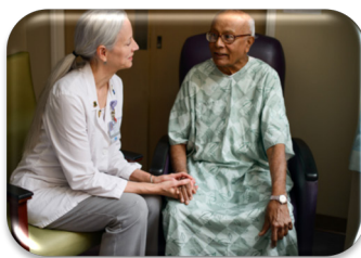
Adults with chronic illness